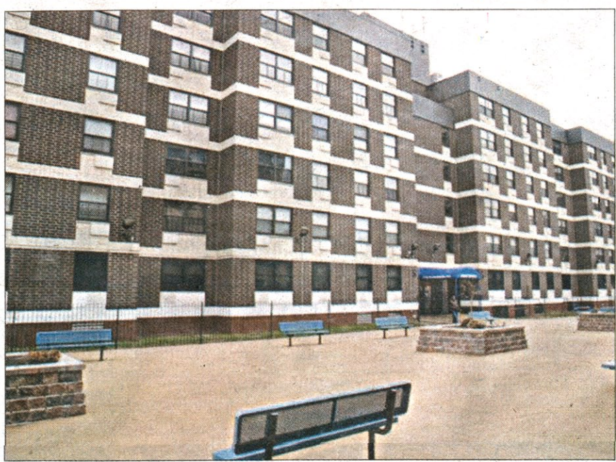
A tidy courtyard is among the new amenities at Grace Towers Apartments.