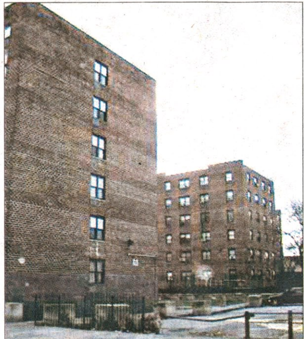
The dilapidated and crime-plagued Remeeder houses will soon get a comprehensive overhaul.